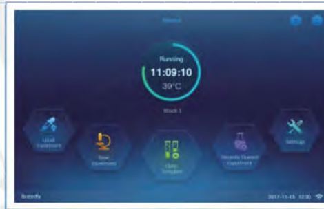
Operation Interface on Device