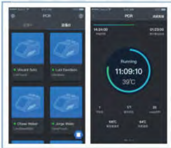
Remote Operation Interface on Mobile Phone App